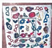
Drawstring Bag Project